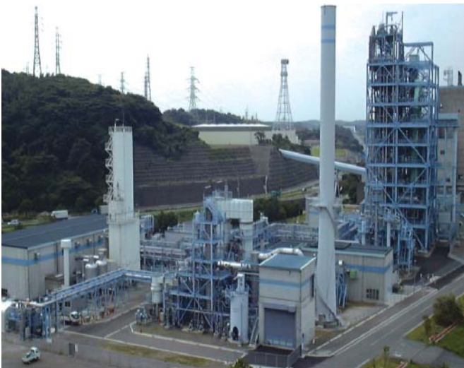
Photo 1 Pilot test facilities

In the U.S., there is a proposed project to combine a hydrogen gas turbine generation system or a fuel cell power generation system that uses coal-derived hydrogen with a CO 2 separation, collection and segregation system. EAGLE technology is not only expected to meet the future demands of a hydrogen society, but is also expected to meet the demands of today.