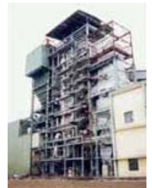
Photo 1 CFBC appearance

refinery (300 t/hr), and Ube Industries, Ltd.'s Isa plant (210 t/hr). An example of an RDF-fired boiler is Sanix Inc.'s Tomakomai plant. The biomass fuel is mixed with coal and combusted, thereby decreasing CO 2 emissions.